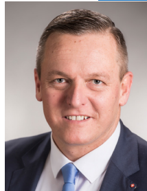
MARIO KUNASEK Federal Minister of Defence