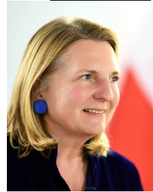
KARIN KNEISSL Federal Minister for Europe, Integration and Foreign Affairs