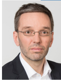
HERBERT KICKL Federal Minister for the Interior