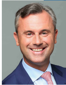
NORBERT HOFER Federal Minister for Transport, Innovation and Technology