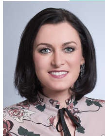
ELISABETH KÖSTINGER Federal Minister for Sustainability and Tourism