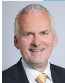
JOSEF MOSER Federal Minister for Constitutional Affairs, Reforms, Deregulation and Justice