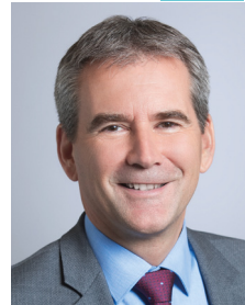
HARTWIG LÖGER Federal Minister of Finance