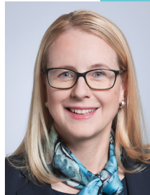
MARGARETE SCHRAMBÖCK Federal Minister for Digital and Economic Affairs